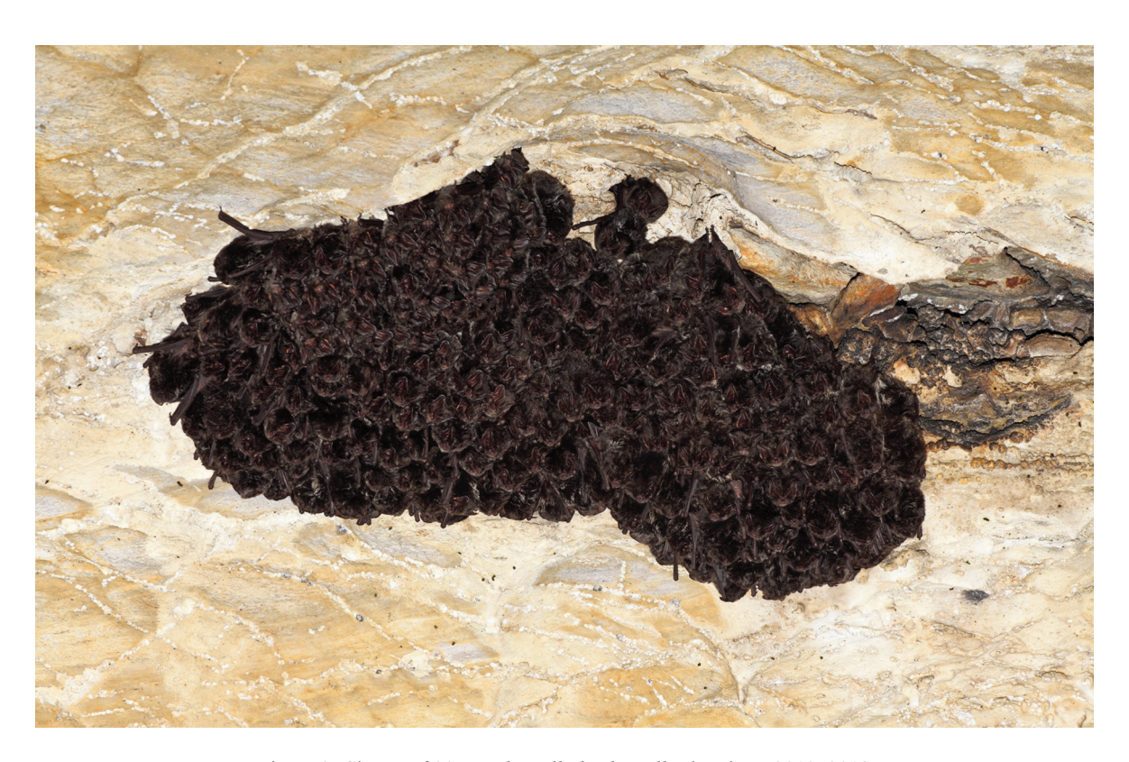
Figure 2. Cluster of 205 Barbastella barbastellus in winter 2012–2013 (cave of Rio Martino, Crissolo, Cuneo, North West Italy).

In 2009 and 2010, captures were also carried out to verify the use of the cave as a swarming site. The captures were made during the nights of 16–17 August, 18–19 September 2009 and 15–16 September 2010, using a harp trap at the entrance of the cave which was active from sunset until 04:00. All individuals captured were identified to species level, and the sex, reproductive status, and age according